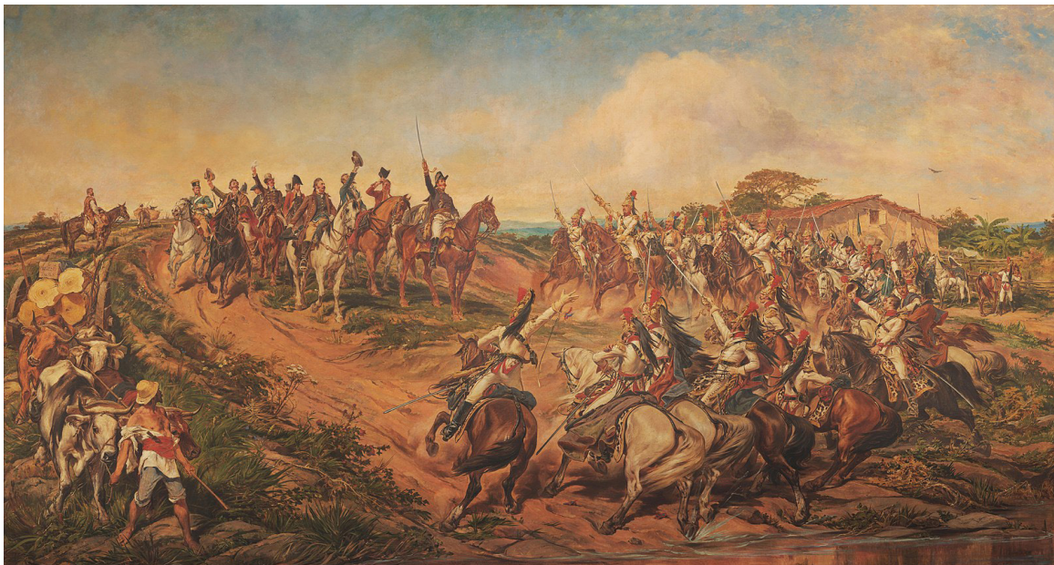
Document B: "Independence or Death"

Source: Pedro Américo, 1888, from the Museu Paulista, São Paulo. This work is in the Public Domain. https://commons.wikimedia.org/wiki/File:Pedro_Am%C3%A9rico_-_Independ%C3%Aancia_ou_Morte_-_Google_Art_Project.jpg