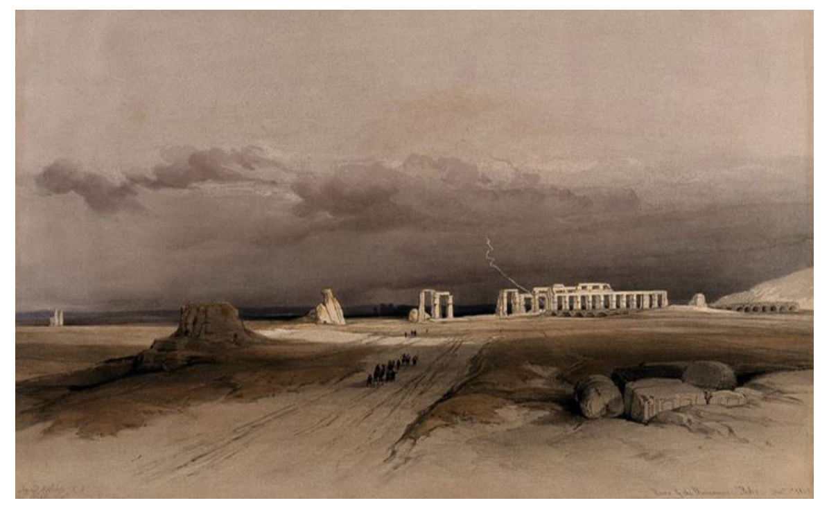
Image 1: The ruins of the Rammeseum at Thebes, Egypt, where the "Ozymandias" statue fragments were salvaged.

In emphasizing the decay of Ramses' legacy across time and space, the poems allude to existential questions for the historian and the history teacher: what to remember, what perspectives to emphasize, and why? Perhaps our historical lenses should be focused less on "Ozymandias" himself and more on the sands in which he nearly drowned forever . . . less on the marbles of the Athenian acropolis and Michelangelo's David, and more on the changes in atmospheric and ecological conditions which have forced their respective restoration or retirement from public space to avoid the same fate as "Ozymandias." This article argues that in our historical narratives of pharaohs, caesars, caliphs, sultans and khans, the environment also needs a central role. In addition to the conquests of the British Empire, world history courses should enable students to investigate why Shelley, in a separate poem, suggested, "Hell is a city, much like London—a populous and smoky city."