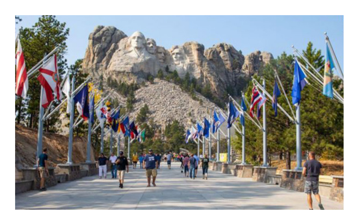
Image 5: Mt. Rushmore, where ecology in the Black Hills of South Dakota was reconfigured as a monument to American presidents. The historical ownership and use of the land is not without controversy.

The current inhabitants of a United States built on exploited energy and resources, including slave labor and neo-colonial dominance of foreign markets, continue to debate the instruction of sociopolitical and economic history. State curricula, standards of instruction, and textbook selections are made by panels appointed by party-affiliated governors or legislatures and the content that informs both teachers and students is identity-affirming. A textbook comparison by the New York Times revealed how California and Texas might lack cultural consensus on "fundamental questions—how restricted capitalism should be, whether immigrants are a burden or a boon, and to what extent the legacy of slavery continues to shape American life," but their processes of curriculum-development and textbook adoption both demonstrate how "classroom materials are not only shaded by politics, but are also helping to shape a generation of future voters."23 This politicization of content applies to the environmental history, or typically lack thereof, in history textbooks for secondary education. The same study noted that while the California version of a textbook references the challenge of "balancing industrial production and environmental concerns," the Texas version "celebrates free enterprise," critiquing environmental policies that regulate the economy. Both texts view climate change as primarily a concern for future economic activity and infrastructure.<sup>24</sup>