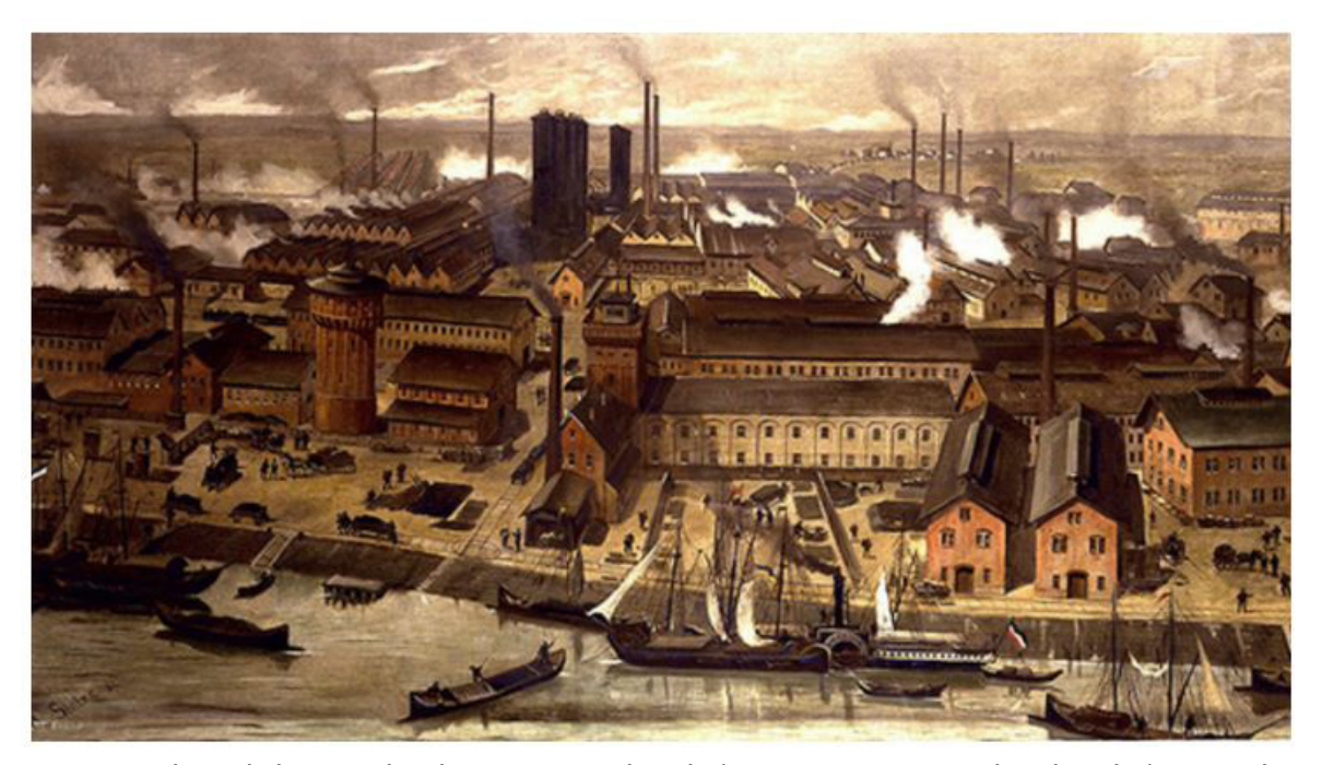
Image 3: Industrial plants on the Rhine river at Ludwigshafen.

The cultures of modern, industrialized states advance historical narratives that legitimize their political and economic conquests while belittling their ecological abuses. This continues a trend in historiography across time and space: whether presented by minstrels or bards, African griots or Confucian court scholars, history has routinely been formed and financed in the processes of affirming cultural identities and legitimizing the political rule of kingdoms, nations, and empires. Students in world history courses today are heavily exposed to the creation of states and imperial processes of conquest. Political, economic, and social relationships are emphasized, and when the environment is included in these traditional historical narratives, it is often only as a resource for exploitation or an obstacle to be outmaneuvered. Almost universally, students in our world history courses will learn how, in the words of J.R. McNeill, "the most powerful states and societies regard adjustments to