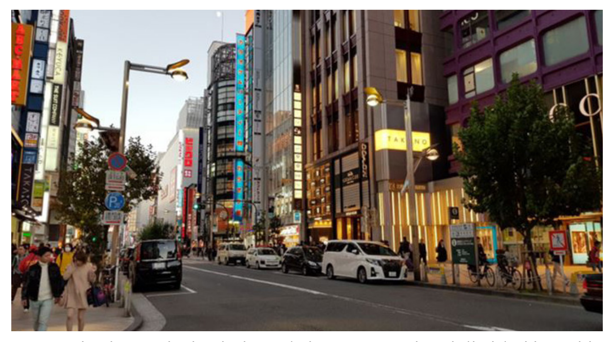
Images 4: Urban density in the Shinjuku district of Tokyo, Japan (2017). The end of both feudalism and the rule of shoguns during the Meiji era, starting in 1868 CE, led to rapid westernization and industrialization of the archipelago nation.

to abundant resources, fossil fuel energy, and rapid economic growth, patterns that will not easily be altered should circumstances change, and the behavior of human economy in the twentieth century has increased the inevitability of change."<sup>21</sup> In these states, which are also largely democratic, this culture directly dictates policy-making in politics, economics, and education . . .