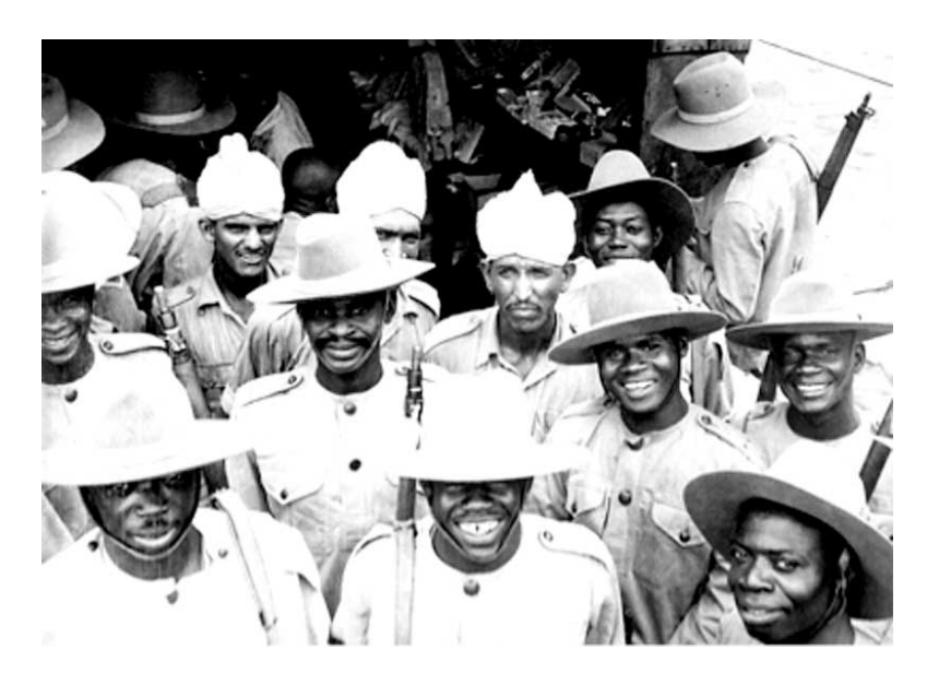
Figure 2. 81st West African Division and Indian Colonial Soldiers in Burma, 1943.