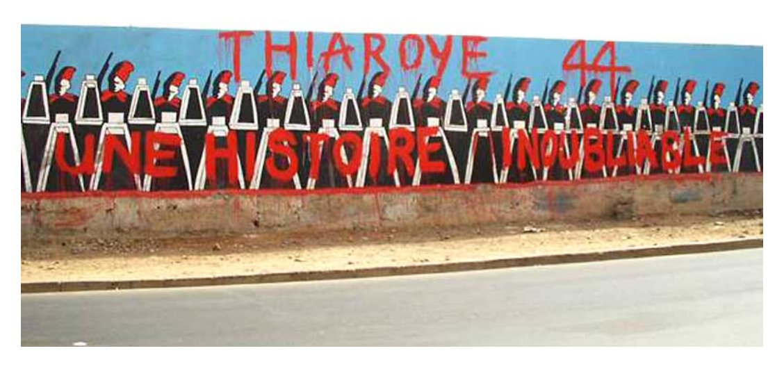
"Thiaroye 44, A Story Never to be Forgotten." Mural commemorating the 1944 Massacre.

[Originally published in World History Connected, Vol. 12 No. 1: Winter 2015]