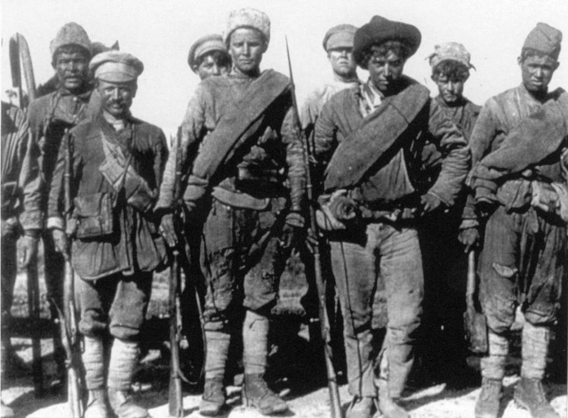
Image 1: Russian Soldiers during the Civil War, Summer, 1919.