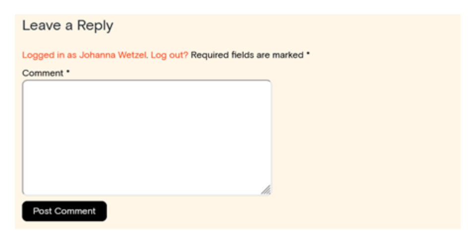
Image 3: Comment Function: Global History Dialogues website.

Through the reply and comment functions, it is possible for teachers as well as learners and other users of the GHDP website to enter into direct contact with the authors of specific works. This space is meant for dialogue and exchange and can be used in global history teaching to create research partnerships, exchange ideas (i.e., about experiences of doing oral history research), or to connect students with researchers working on similar topics.