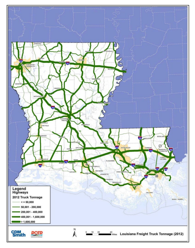
Figure 1. Freight significant highways in Louisiana [1]

that the highest number of crashes involving commercial vehicles in Louisiana occurred on rural state roadways [4].