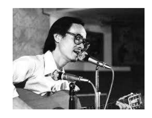
I shall revisit (Trinh Cong Son)