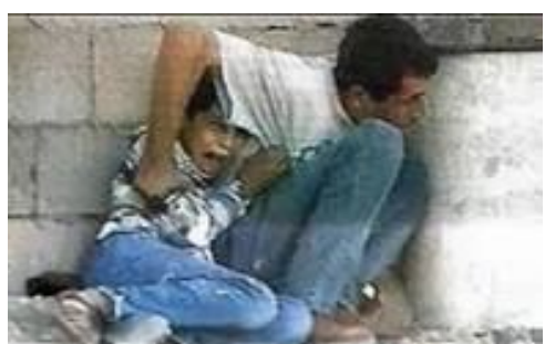
Mohammed Al-Durra: A Song for Jerusalem