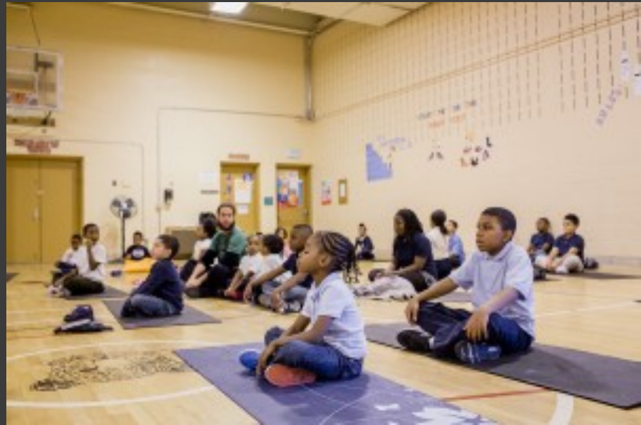
Holistic Life Foundation, Baltimore, Maryland

“how to work openheartedly with life just as it is”