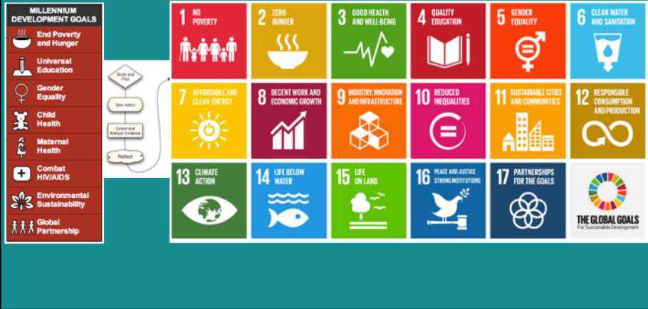
Dann Slide 1