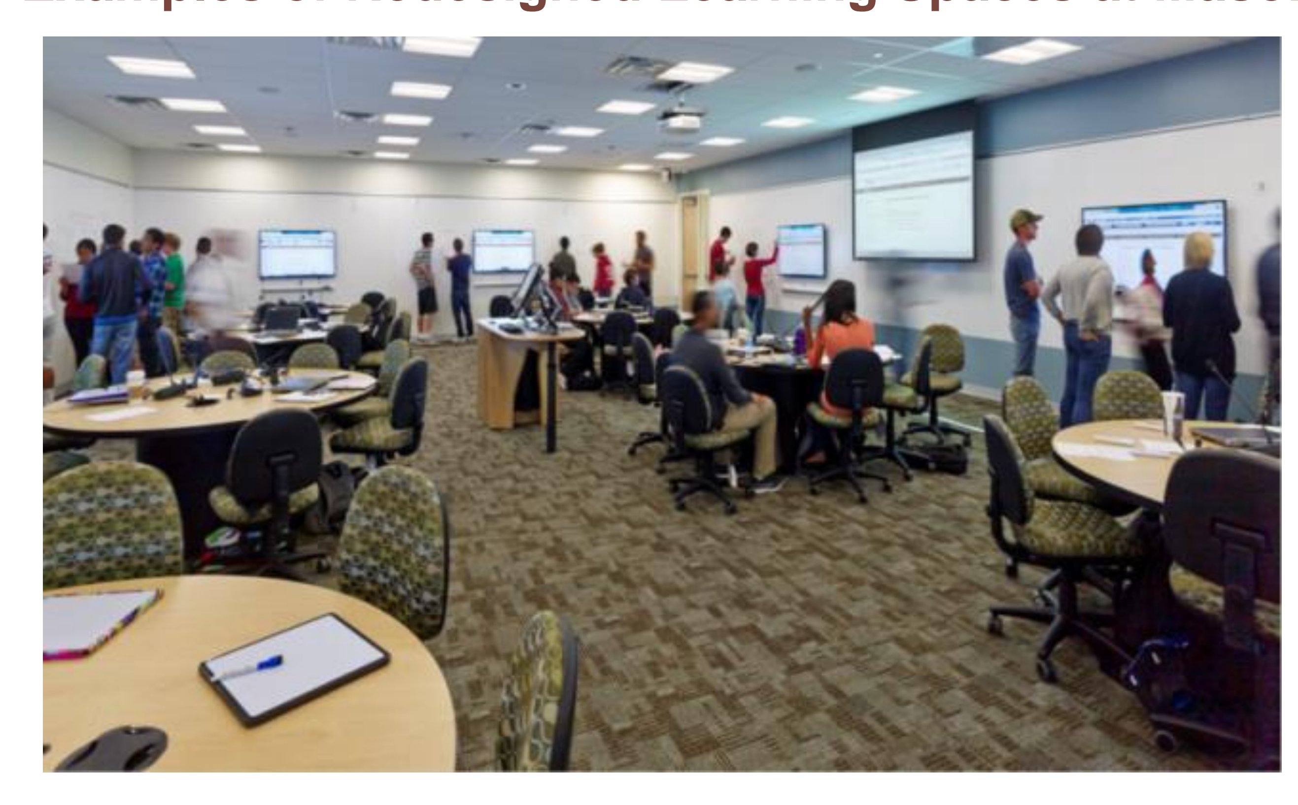
Exploratory Hall L-102, Active Learning with Technology Classroom (Capacity 72 seats)