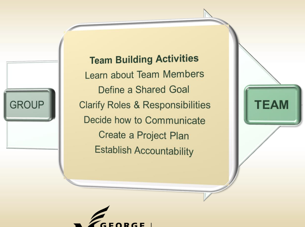
Tip # 3: Provide Tools for Students to Build an Operational Team